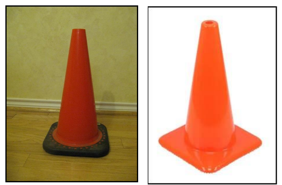
Acceptable Competition Cones

Cone: The cone used in the competition is approximately 17 inches high and is approximately 7 inches at the base of the cone. There are 2 styles of cones that can be used: one type sits on a black 10-inch square base and is the preferred cone, the other has an orange base. A judge can authorize a different style of cone. This possibility arises when the competition is run at a remote location where cones are already owned. The height of the cone and base is approximately 18 inches. The color of the cone is "traffic cone" or "fluorescent" orange. All cones used in the competition should be the same type. The cone and cone base are both considered "the cone". Touching the cone base is equivalent to touching the cone.